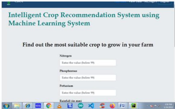
Fig.2. Crop grow materials.