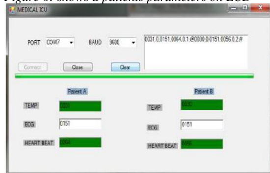
Figure7. cloud based monitoring GUI

Android utility is used to are trying to find after solitary affected man or woman prospering motive of intermingling with the useful resource of way of seasoned and ace. At a second that the health practitioner/Technician login into an application, they'll see the pie format searching out for a flat