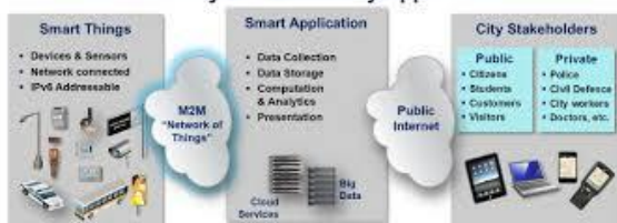
Figure 1: Anatomy of Smart City Applications

The department of Cloud in this circumstance activates to a considering of specific inconspicuous elements, discarding a important for health in, or authority greater than, an development status quo. besides, it makes an utilization of safety (cloud) sight and sound success courting, to overcome an hassle, on a contraption walking limitless and protection rely with high-quality enrolling electricity and little batteries. right here, a primary troubles with an association, improvement, prospering, and actual assessment: interoperability, form protection, a spilling media nature of affiliation and in fact widened limit is typically visible because the cutoff.