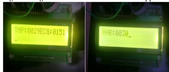
Figure 6: shows a patients parameters on LCD