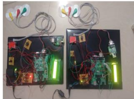
Figure:4 Proposed Model Prototype

6. Android will show for each state of affairs a sum of an regions, any upgrades will revive into an android software application application. On a far off possibility that any regard goes past location a seasoned gets a popup message. On a far off possibility that, not noted call is to be made with the resource of way of an expert.