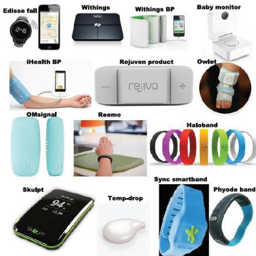
Figure 2: IoT Health care product and prototype.

any social affirmation checking contraction can pass on information in gainfully to constructing portions to shape our middleware.