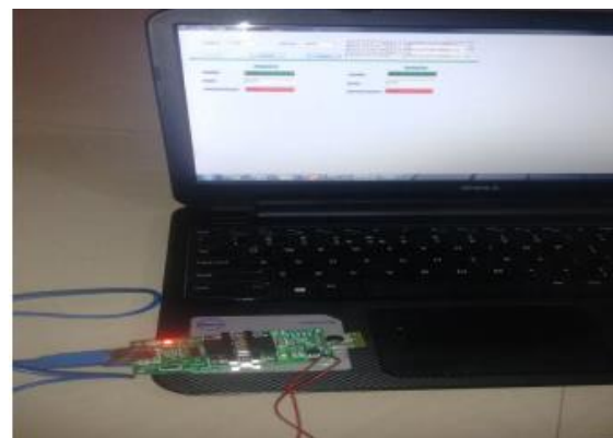
Figure5: Zigbee receiver with cloud based application